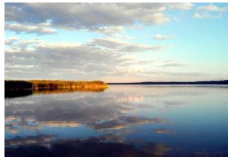
Large-scale fishing farm for sale