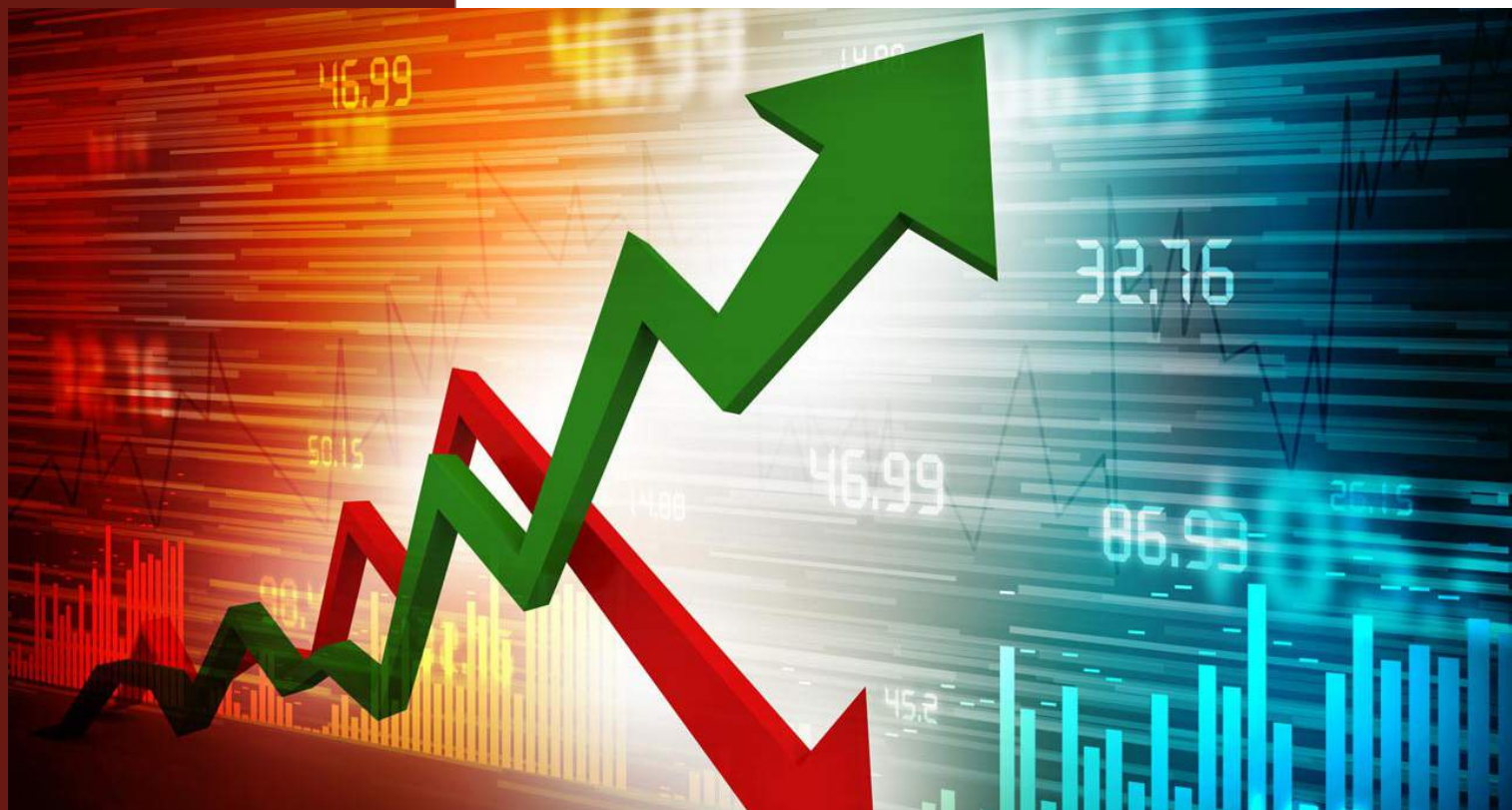
Ukraine Economy: Humdrum Recovery

SP Advisors "Ukraine Economic Overview" | September 2017