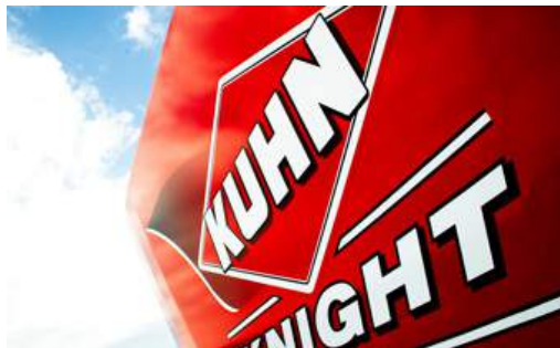
We Invest in Ukraine: KUHN (France)