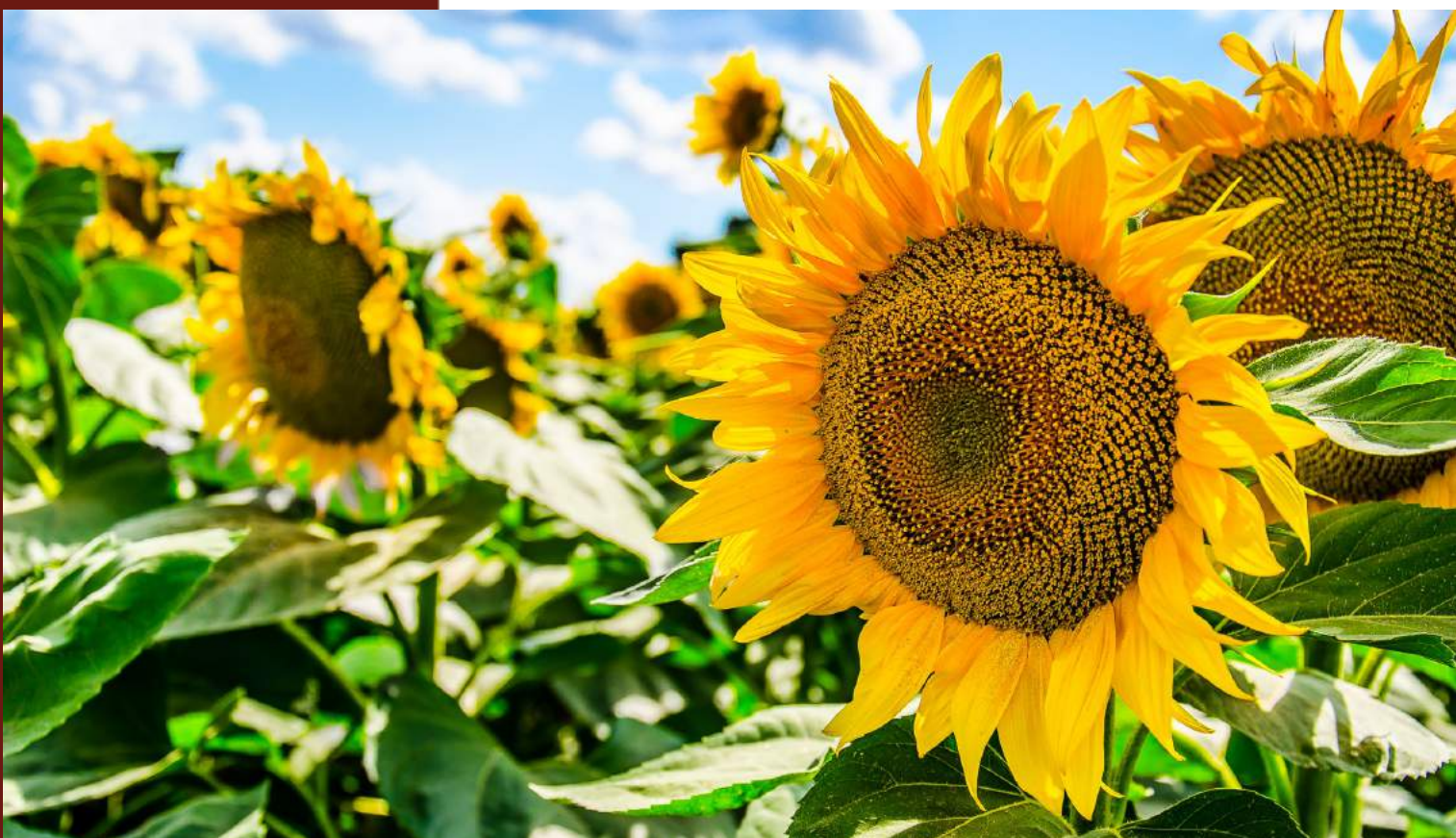
The largest agriculture companies in Ukraine

SP Advisors "Ukraine Economic Overview" | September 2017