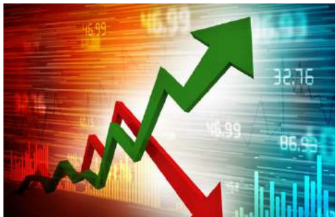
Ukraine Economy: Humdrum Recovery